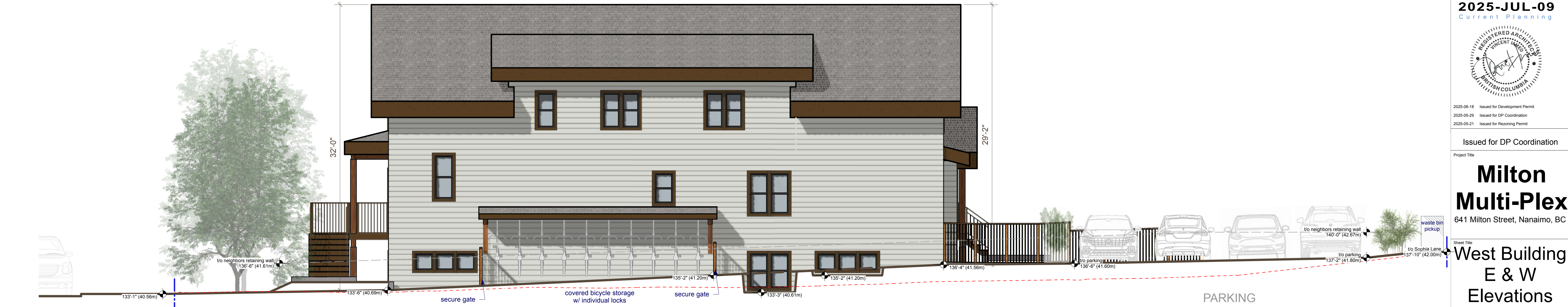
2 West Elevation Scale: 3/16" = 1'-0"