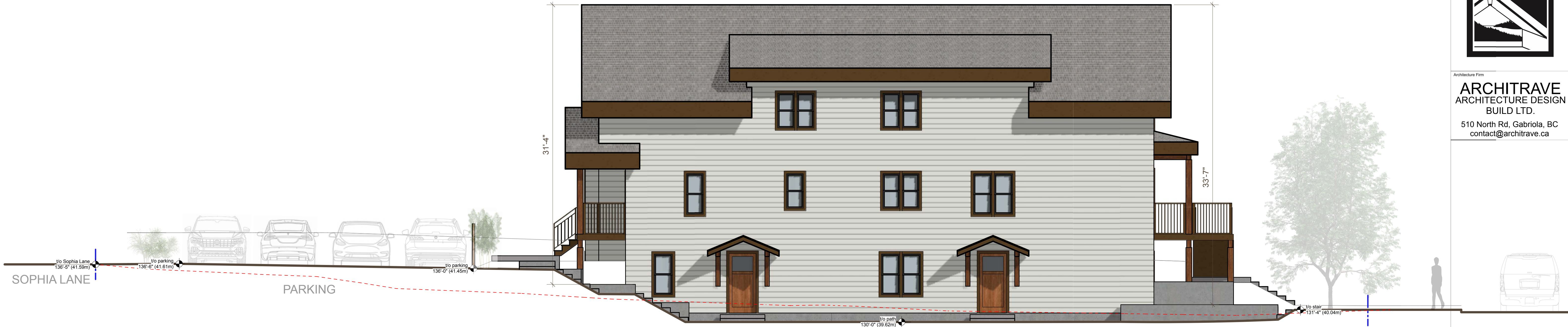
1 East Elevation Scale: 3/16" = 1'-0"